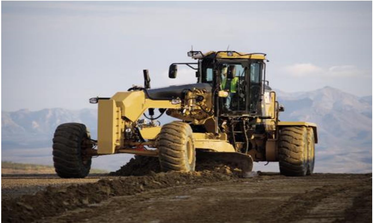
Embankment filling bed preparation @ Bid Bid Sur Road CH: 93+500