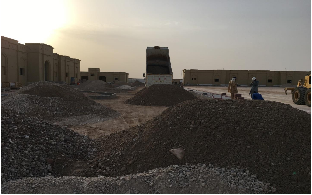
Aggregate base course at Al Bhaja ROP complex.