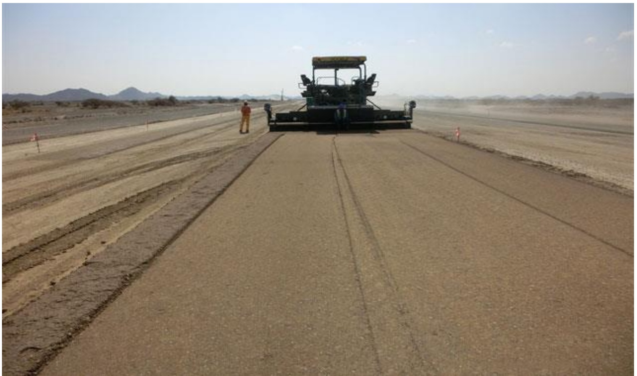
Laying of Aggregate base course