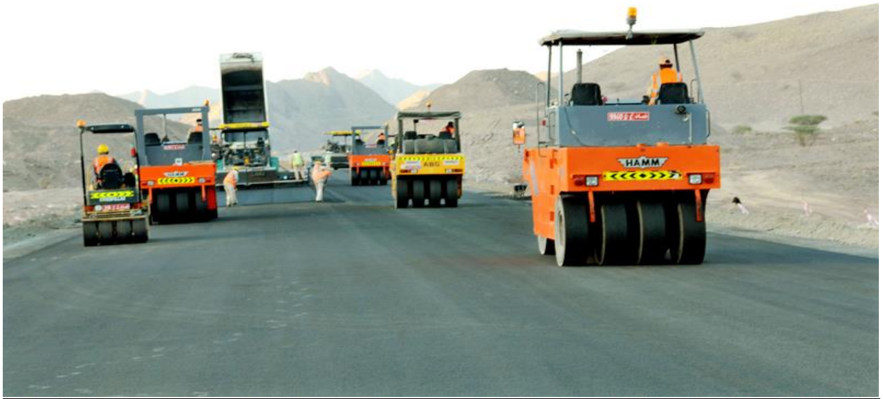
Laying and compaction of Bituminous base course