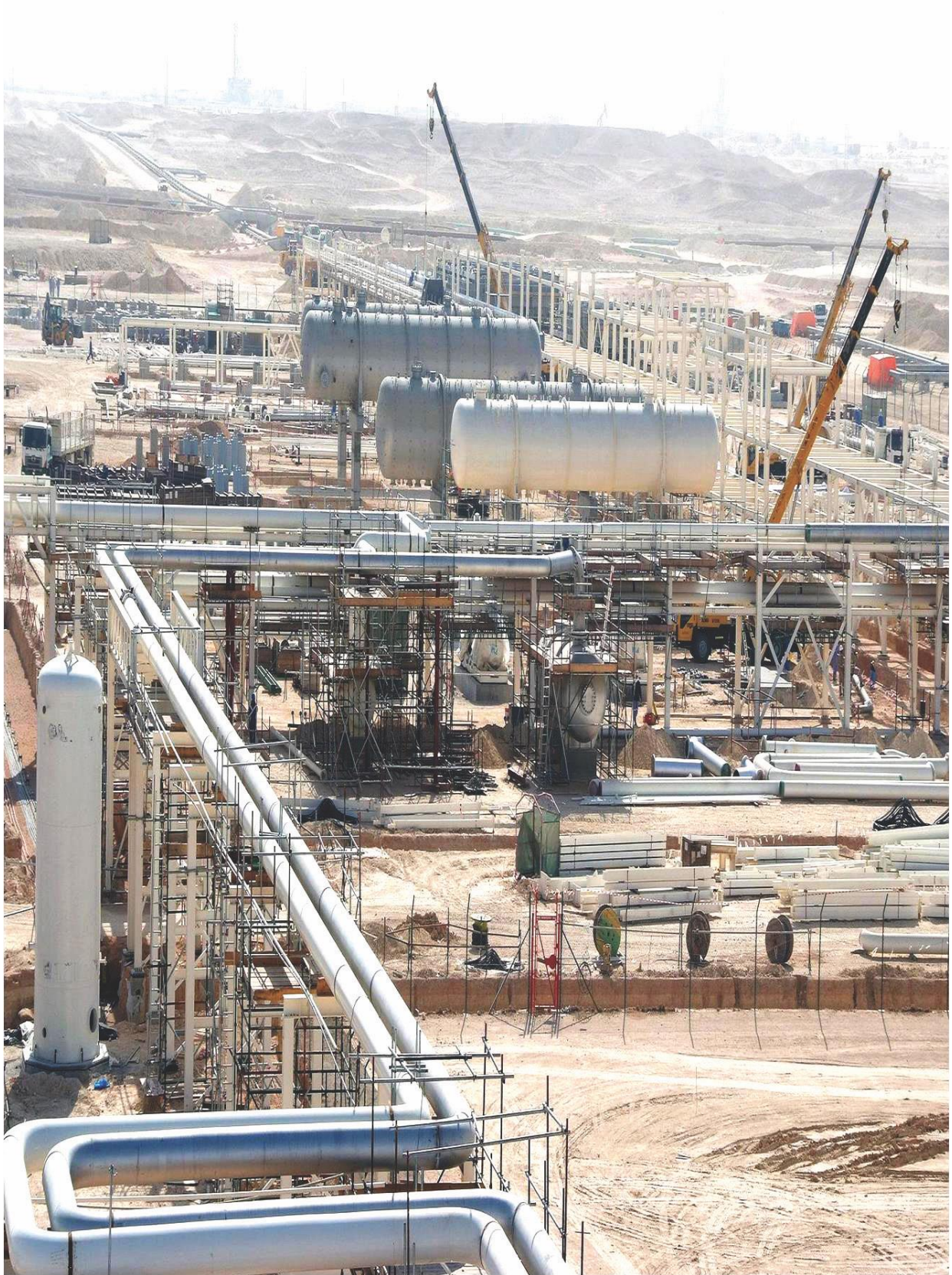
Construction Survey for Amal Steam Project (PDO) for STS LLC