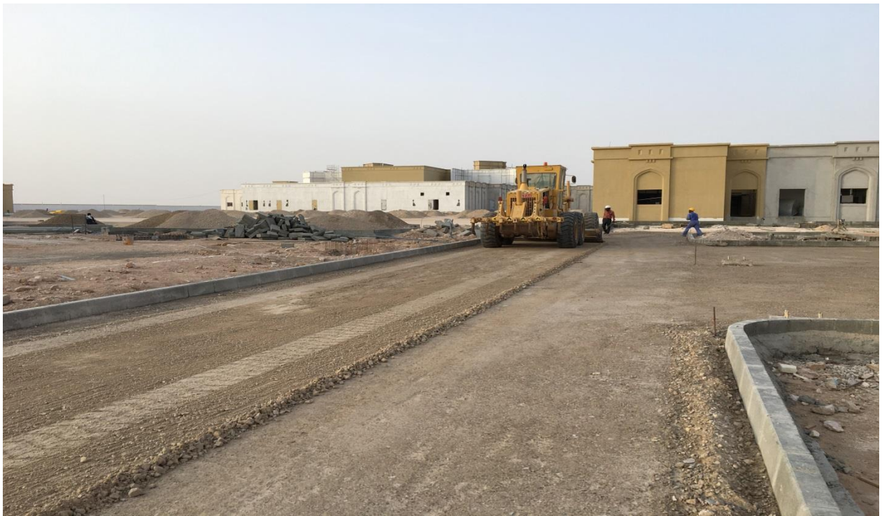
Laying of Aggregate base course at Al Bhaja for ROP Complex