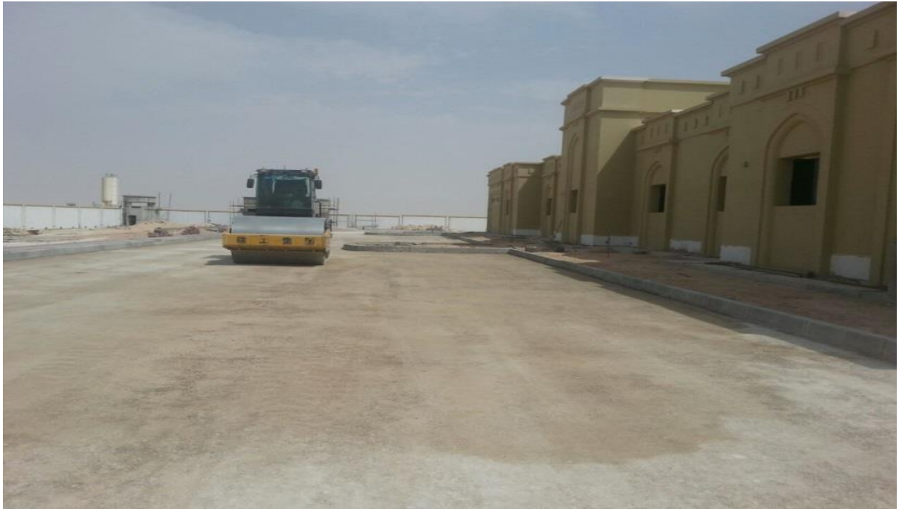
Compaction of Aggregate Base course Al Bhaja ROP Complex.