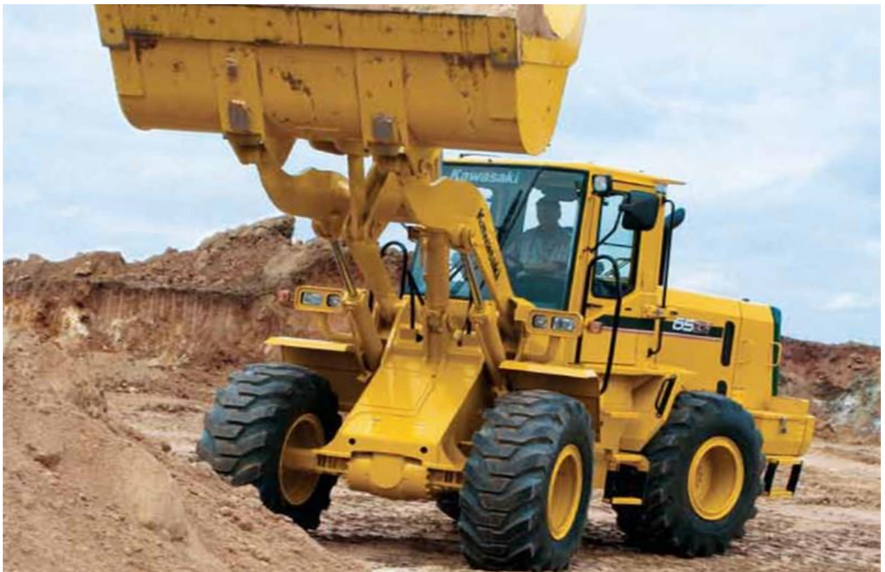
Loading of excavated material