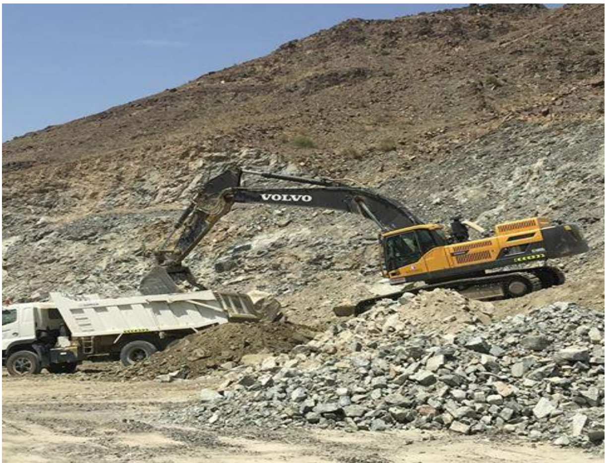
Hard rock cutting for road way