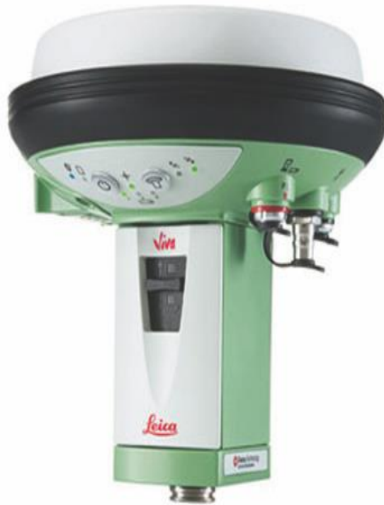
Leica GS15 Viva RTK GPS System