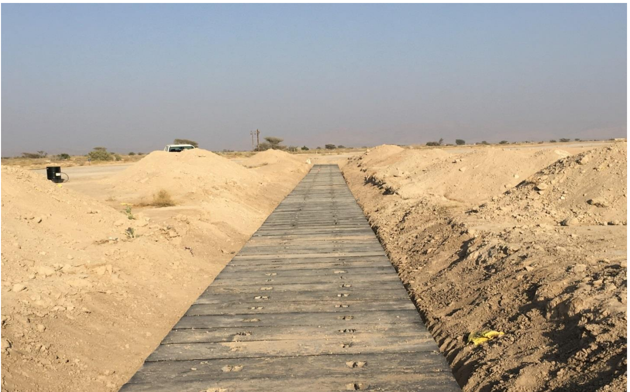
Laid precast protection slab for PAEW water line protection @ Bid Bid Sur Road Project