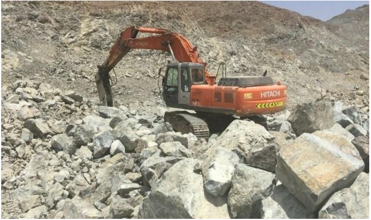
Hard rock excavation at wadi Bani Omar