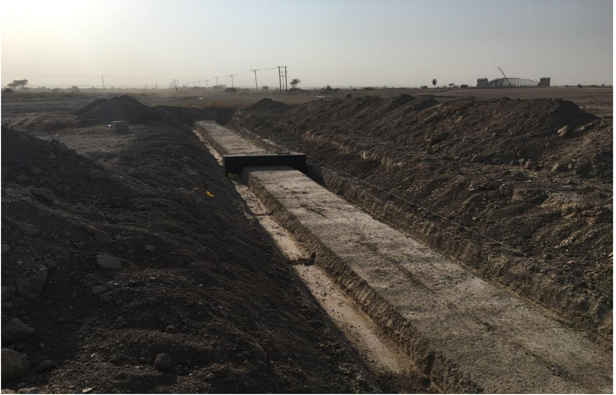
Bed preparation for PAEW water line protection @ Bid Bid Sur Raod project