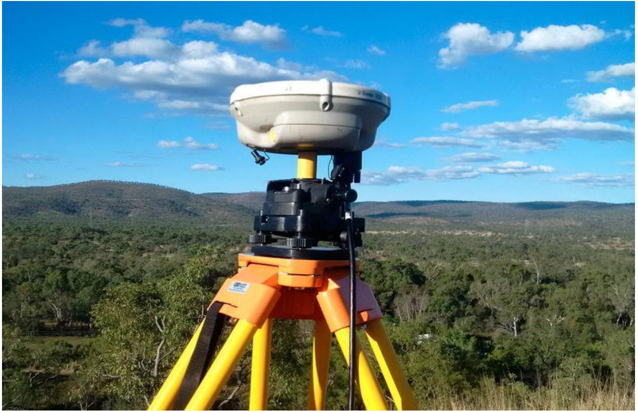
Surveying works at Salalah by using GPS