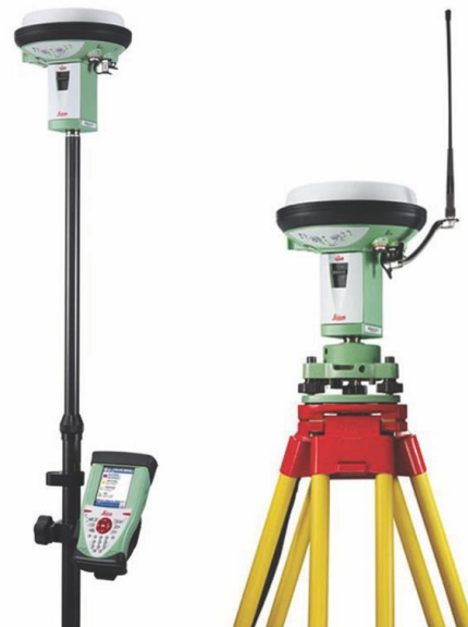
Leica GS15 Viva RTK GPS System