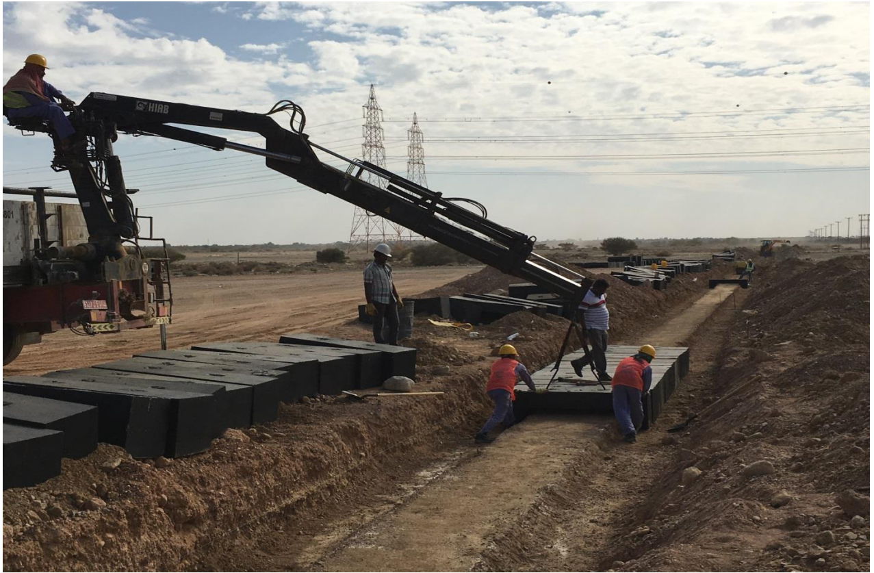
Placing of protection slab for PAEW water line @ Bid Bid Sur Road project.