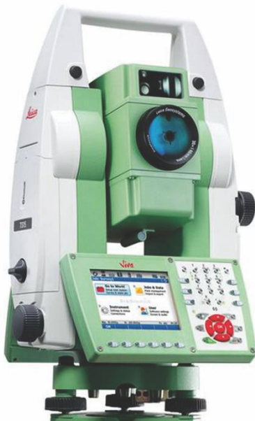
Leica Total Stations TS 11