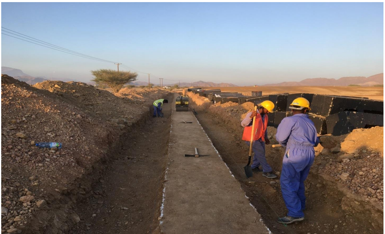
Bed preparation for placing protection slab for PAEW water line